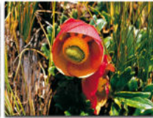
Rima Rima Krapfia weberbauerii