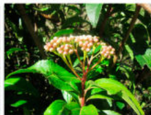
Wallmi wallmi Argentina azangaroensis