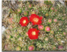
Warqu, Alalqa Casha Oputina Flocossa