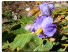
Ñawi pashta Solanum hispidum