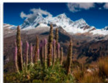
Taulli macho Lunpinus weberbauerii