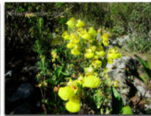
Potocshu, Zapatito del Diablo Calceolaria sp.