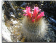
Curicasha Matucana yanganucensis