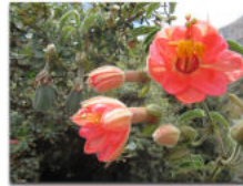
Puroqsh, Granadilla silvestre Passiflora trifoliata