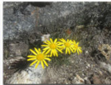
Common name not found Senecio comosus