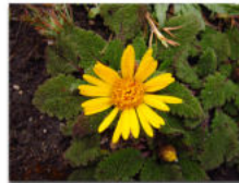
Chawe chawe Paranehelius uniflorus