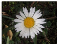
Lleqlish qora Werneria nubigena