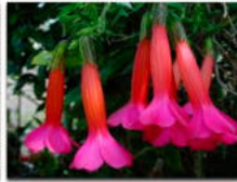
Qantuta, Flor del Inca Cantuta buxifolia