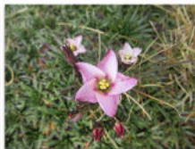
Common name not found Gentianella nitida